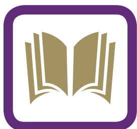
BOOK OF THE CHARITY AWARDS EVENT