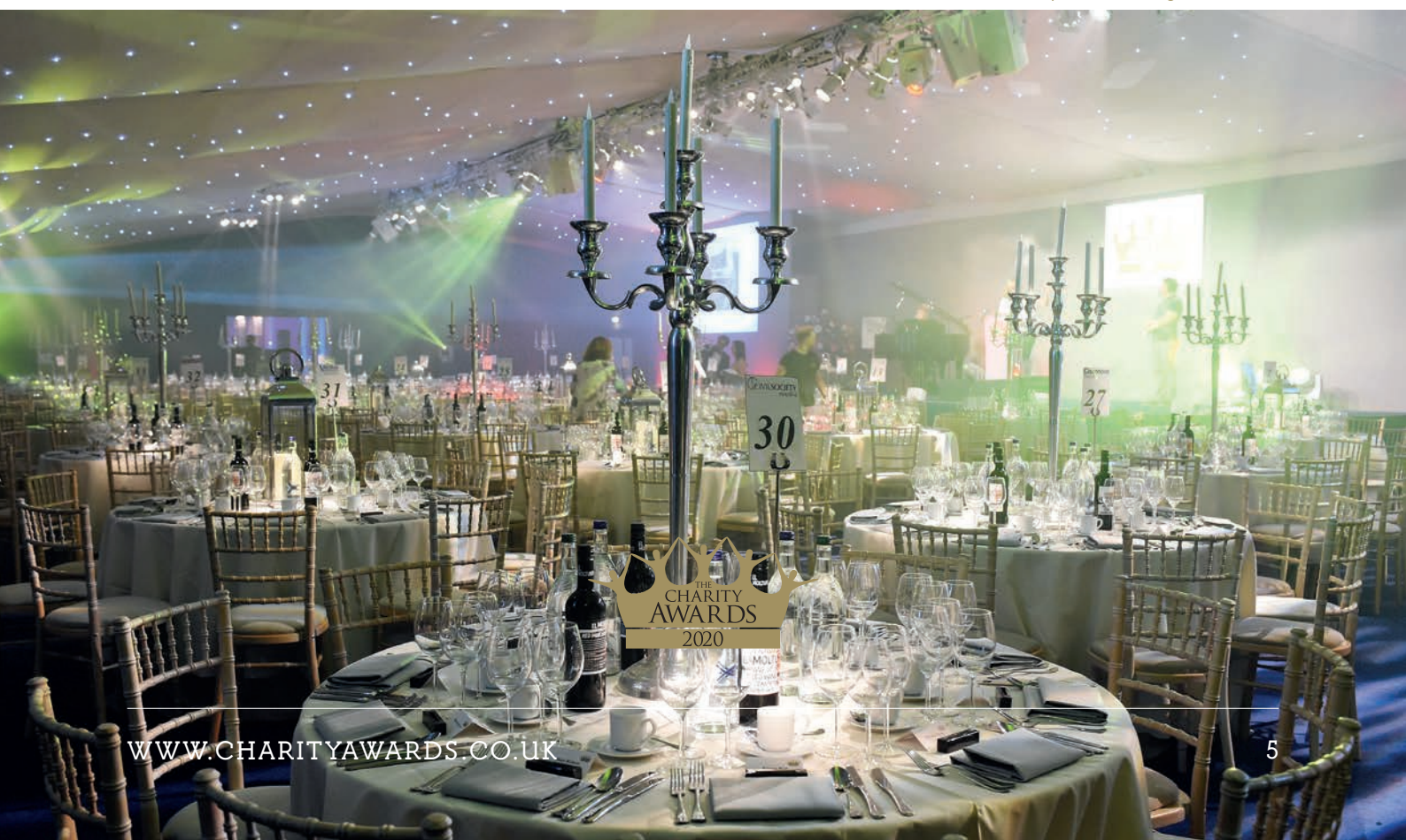
Ceremony tables and dining at the Pavilion

The Charity Award's guest list is an impressive collection of VIPs – chief executives, executive directors, chairs and trustees of the most recognised, high-profile charities. Other attendees include leaders of the sector's main membership bodies, Parliamentarians and an exclusive selection of celebrity hosts and honoured guests.