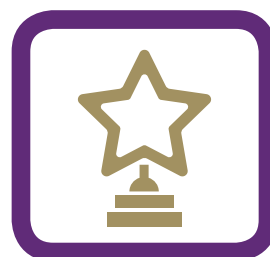
PRIZES DISTRIBUTED TO SHORTLISTED AND WINNING CHARITIES

“Being involved with the Charity Award, both as a sponsor and a provider of bursaries to support the development of leadership within Civil Society, catapulted us into the very centre of the sector. .”